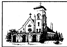
Immaculate Conception Church

OUR MISSION: St. Bridget's Church is called to respond to the wonderful and incredible good news of Jesus by attracting a diverse community of believers who worship, love one another, advocate, and serve as catalysts for change.