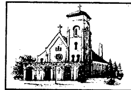
Immaculate Conception Church

OUR MISSION: St. Bridget's Church is called to respond to the wonderful and incredible good news of Jesus by attracting a diverse community of believers who worship, love one another, advocate, and serve as catalysts for change.