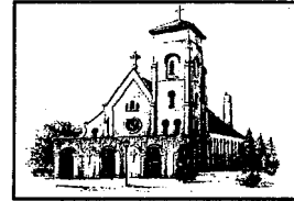
Immaculate Conception Church

OUR MISSION: St. Bridget's Church is called to respond to the wonderful and incredible good news of Jesus by attracting a diverse community of believers who worship, love one another, advocate, and serve as catalysts for change.