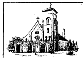
Immaculate Conception Church

www.saintbridgets.net ; Email: rstbridg@dor.org