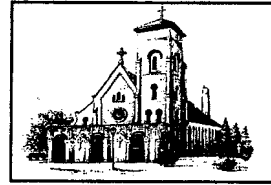
Immaculate Conception Church

www.saintbridgets.net ; Email: rstbridg@dor.org